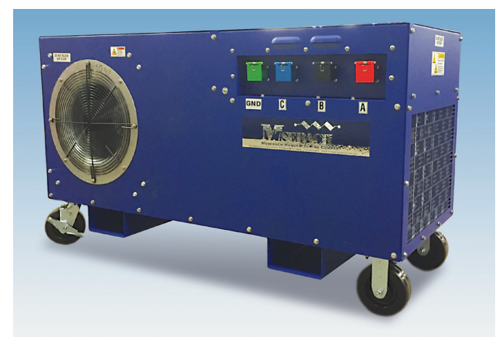
150 kW Portable Electric Heater

Heaters are available in the sizes of 60 kW and 150 kW. Mosebach's heaters are virtually maintenance free and are used anywhere from construction sites and nuclear power plants to fine dining and special outdoor events.