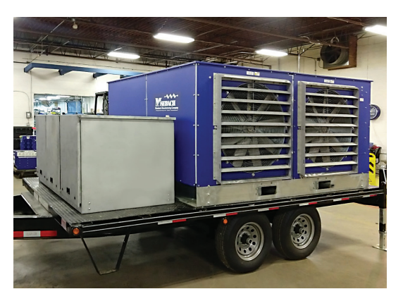
2 MW Trailer Mounted Load Bank

Virtually any of our load banks can be mounted on a DOT certified dual axle trailer with brakes to meet your needs. Trailer mounted units can come with electric cable reels or a job box for easy clean up and cable storage. Trailer mounted units allow customers to test multiple generators in one day.