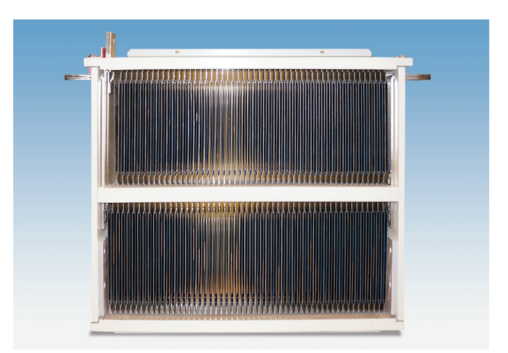
Dynamic Braking Resistor Grid for Off-Highway Trucks

We manufacture OEM grids as well as aftermarket grids for locomotives and mining trucks around the world.