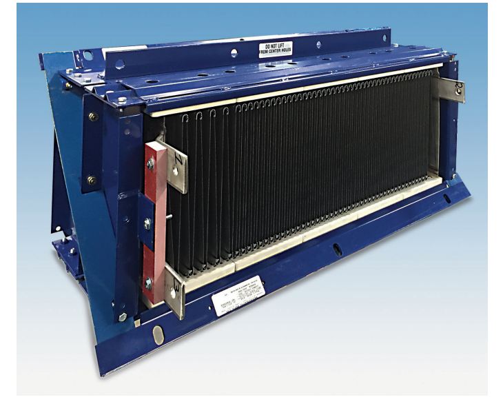
Box Style Grid for EMD Locomotives