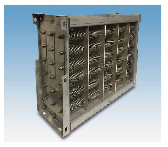
Suspended Wire Resistor

Mosebach's suspended wire resistors are NiCor metal coils supported by Mica that can sustain anywhere from 0-3000 kW. These are used in conjunction with the cross wire resistors to get smaller kW steps.