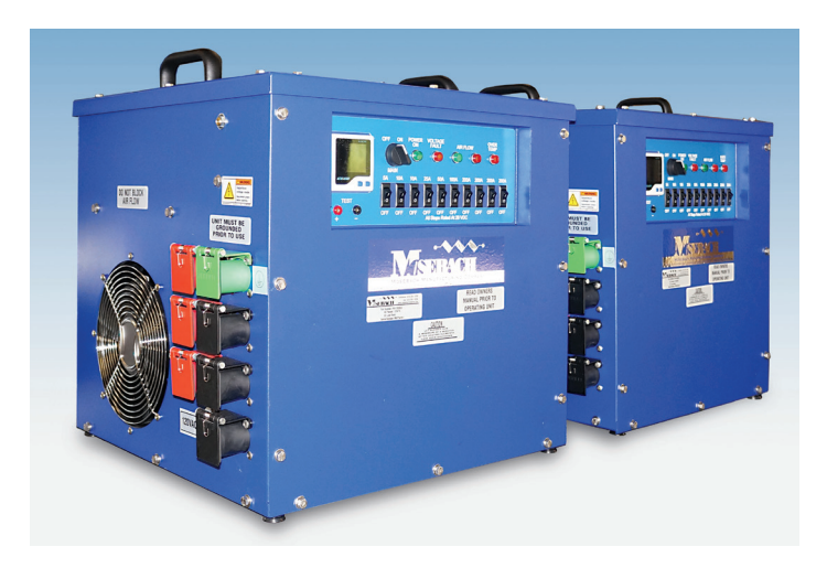
DC Load Banks

Our direct current line of load banks is perfect for customers who need to test DC power systems or battery systems. With a variety of voltages and amp capacity, we are sure to have what you require! We offer a variety of both portable and permanently mounted units.