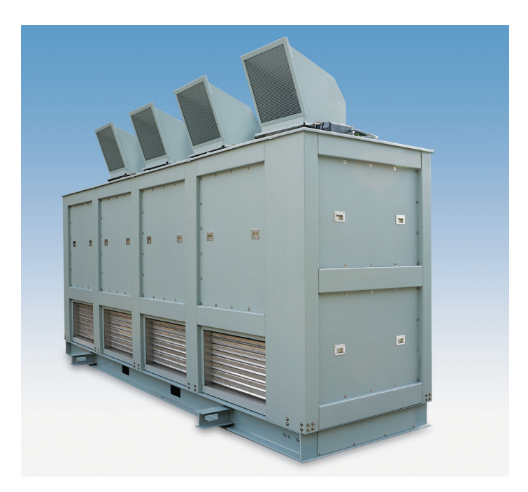
Dual Voltage 4000 kW DC Load Bank