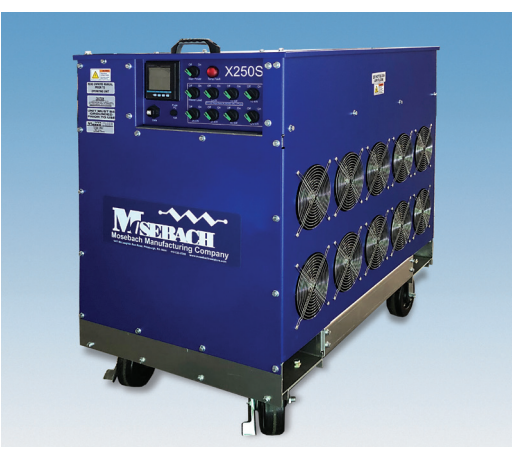
250 kW Portable Load Bank

Our resistive load banks range from small and portable to permanently mounted outdoor units. We offer power ranges from 30 kW to 3000 kW and higher. Our load banks can test all singlephase and three-phase voltages including 600V and 4160V.