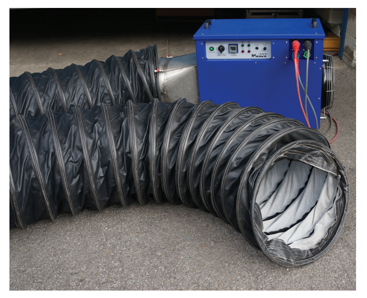
60 kW Small Lightweight Portable Electric Heater